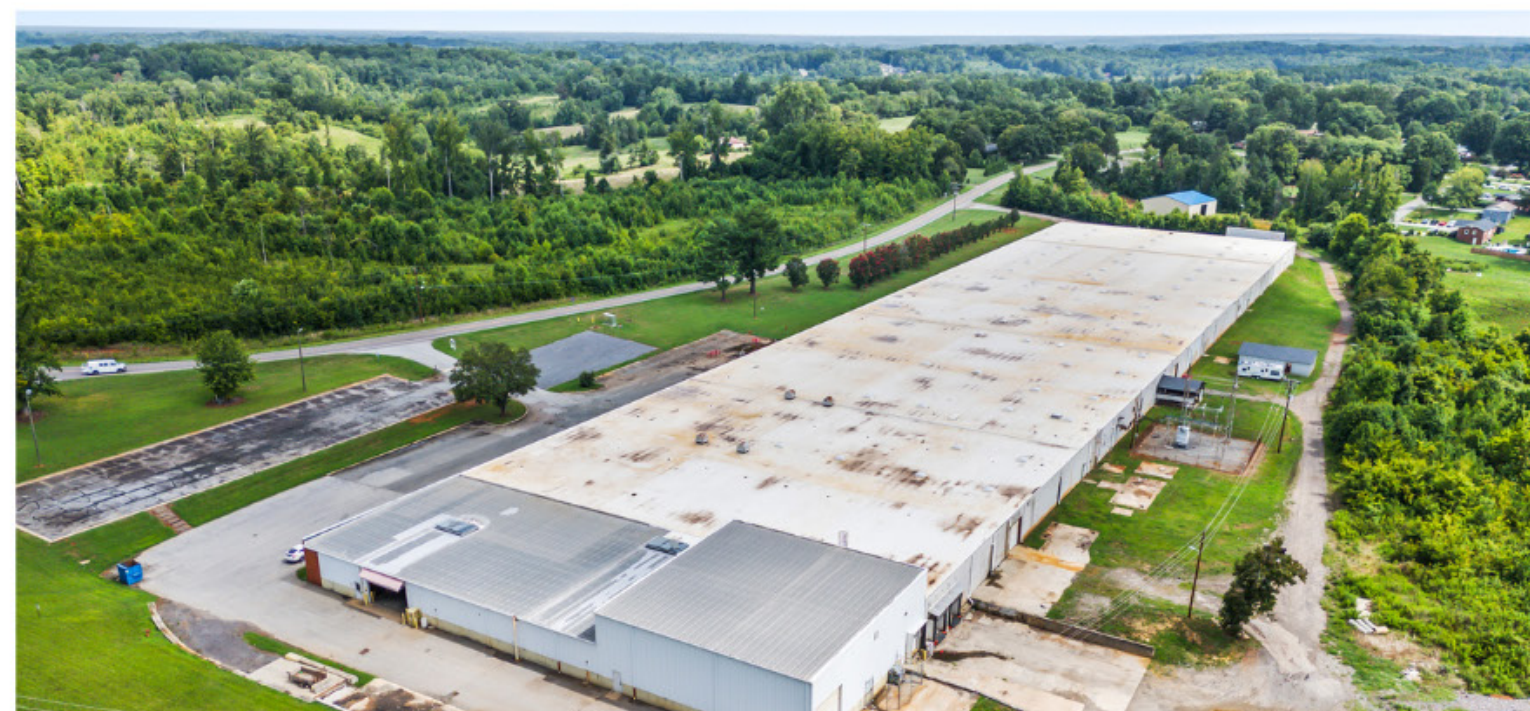
VALUE ADD INDUSTRIAL