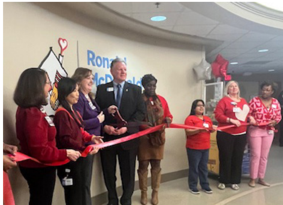
RONALD MCDONALD HOUSE