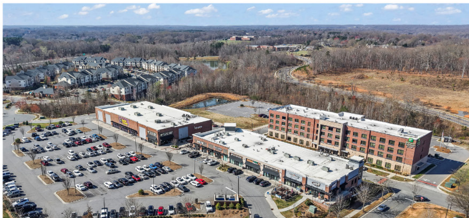
PRIME RETAIL SHOPPING CENTER