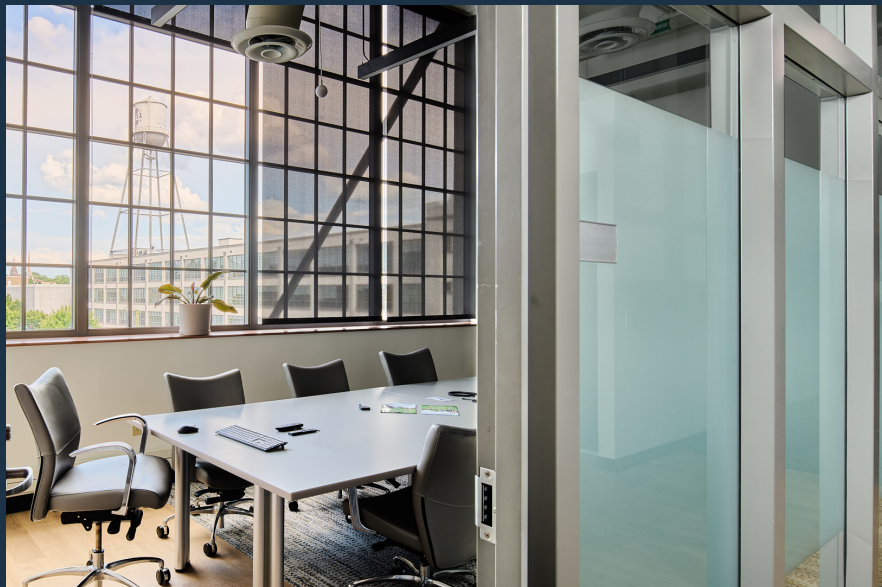
CONFERENCE ROOM 3