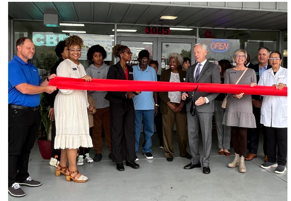
SOUTHSIDE DISCOUNT PHARMACY