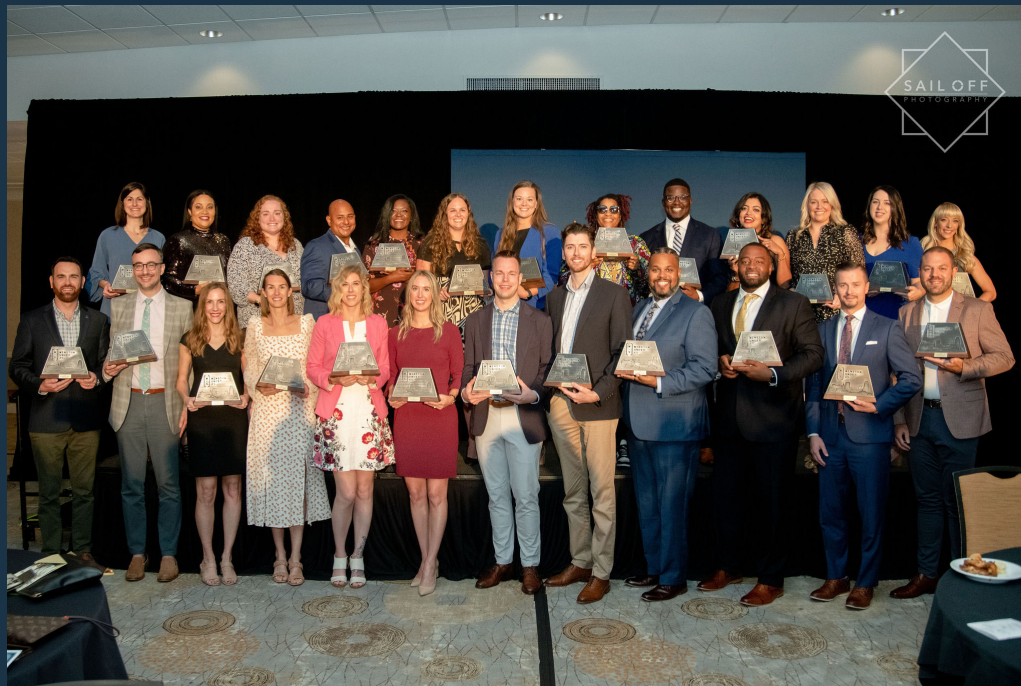
2023 WINSTON UNDER 40 LEADERSHIP AWARD RECIPIENTS

The Winston Under 40 program promotes talent recruitment, retention, and development by offering a broad range of opportunities for young professionals. Focusing on three core goals of leadership development, community involvement, and networking opportunities, the program helps to build our next generation of leaders and create a collective network of young professionals across all industries.