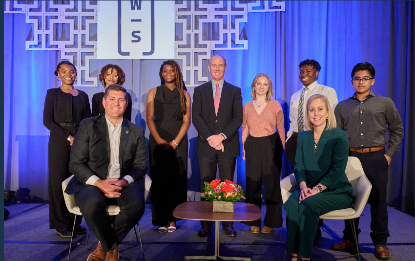
STATE OF EDUCATION | NOVEMBER 2023

1,700 STUDENTS MENTORED IN SENIOR ACADEMY